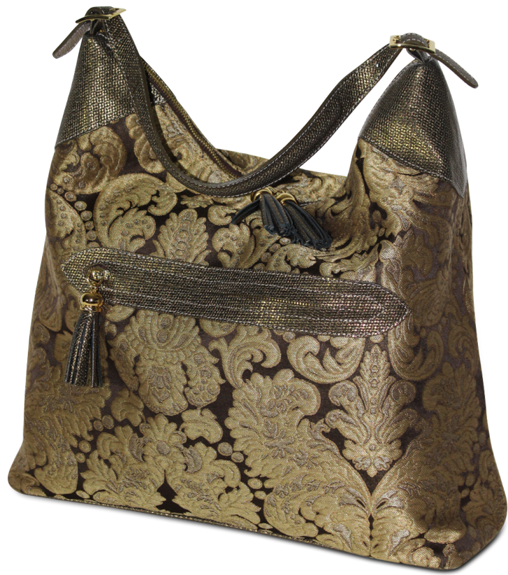
■ CD923 _ SHOULDER BAG b.35 x p.35 x h.16 cm