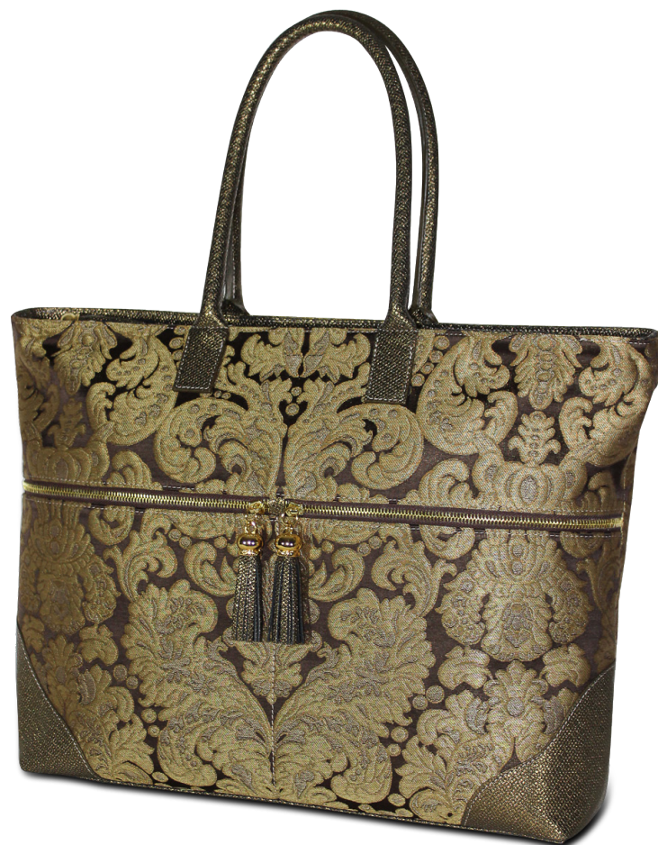
■ CD941 _ EAST WEST TOTE b.45 x p.35 x h.14 cm