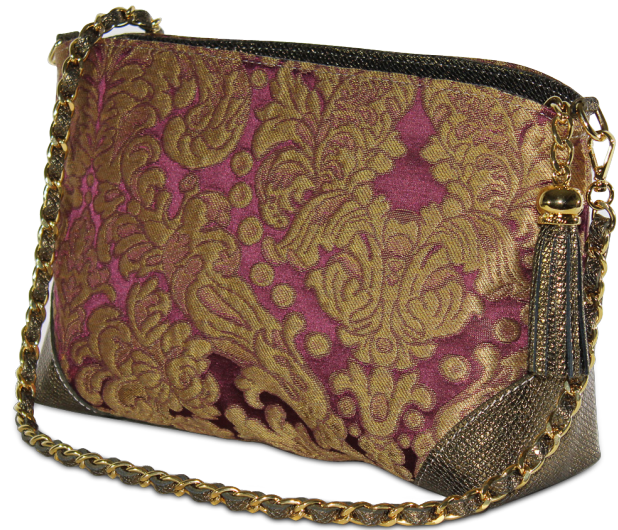
■ CD1070_SHOULDER BAG