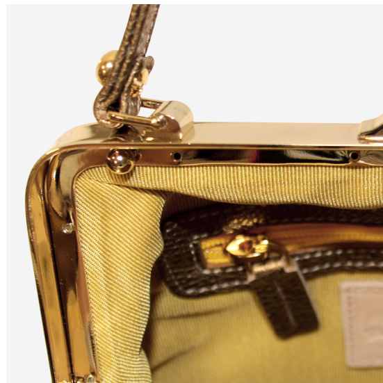
■ CD1092 _ HAND BAG