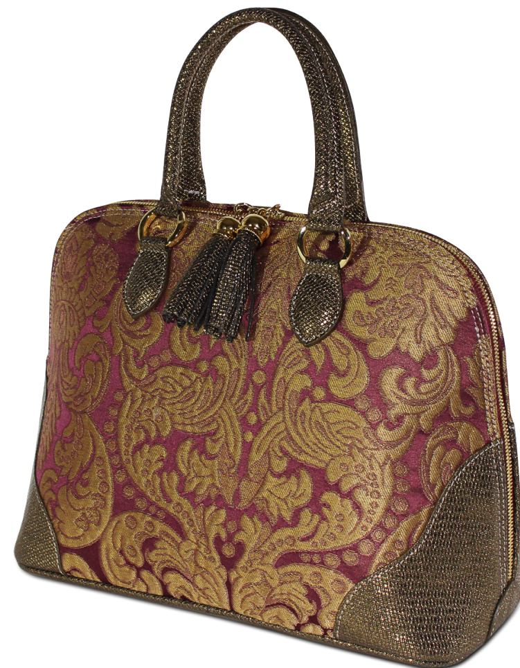
■ CD209_HAND BAG