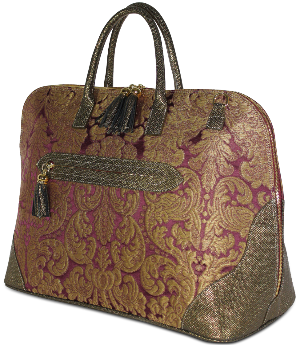
CD936 _ DUFFLE