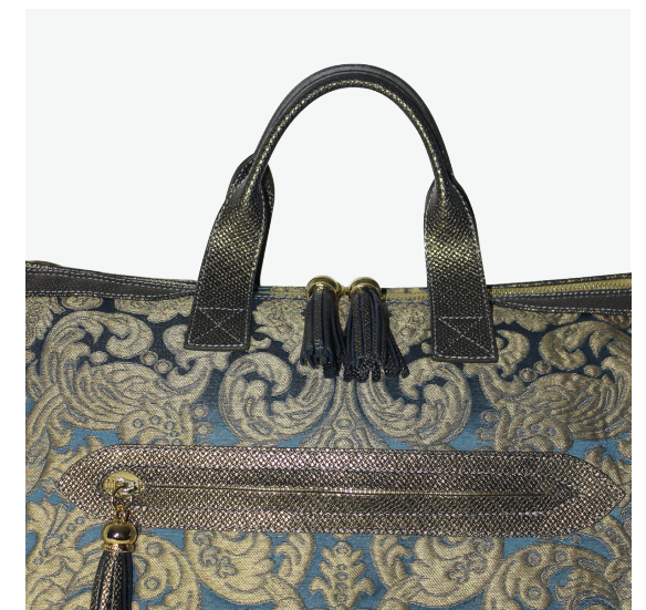
■ CD1124 _ DUFFLE b.50 x p.25 x h.25 cm