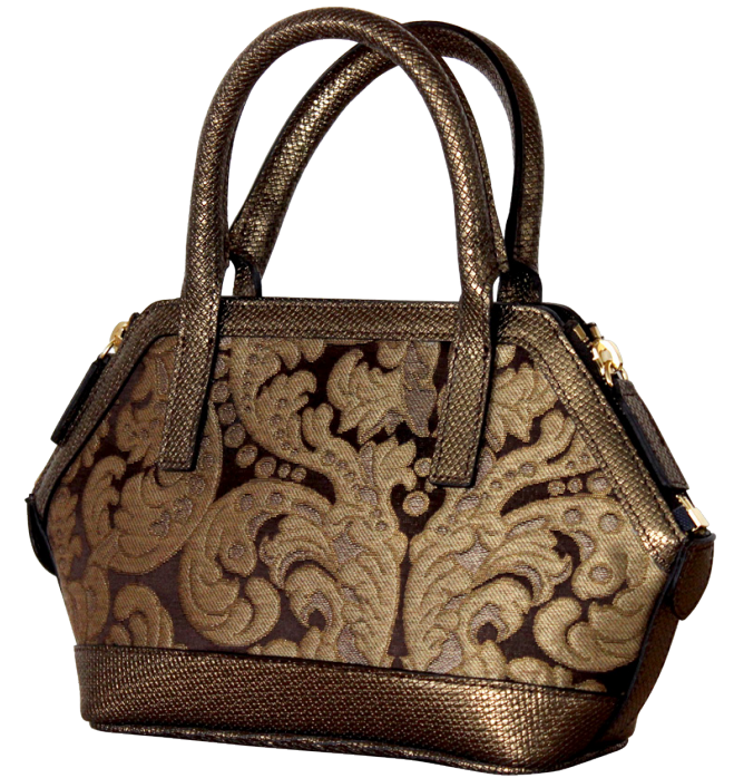
■ CD1302_MINI BAG