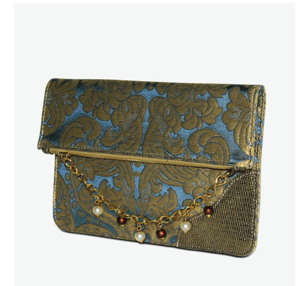
■ CD1210 _ CLUTCH