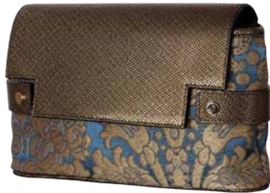
■ CD1303 _ POCLETTE