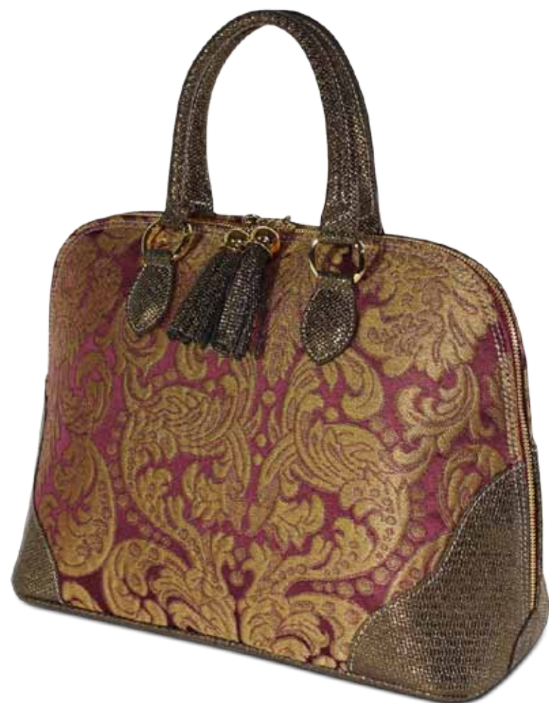
■ CD209_HAND BAG