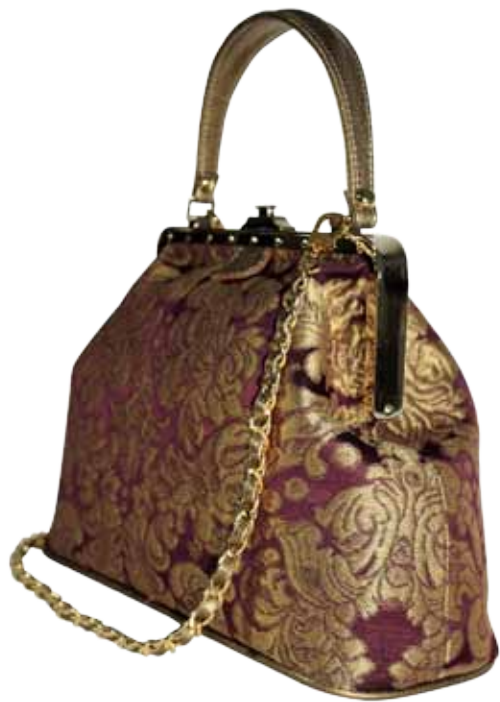
■ CD1092 _ CLUTCH