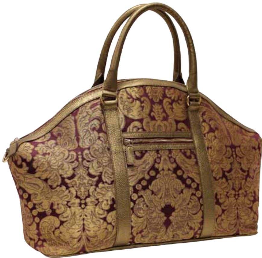
■ CD1304 _ DUFFLE