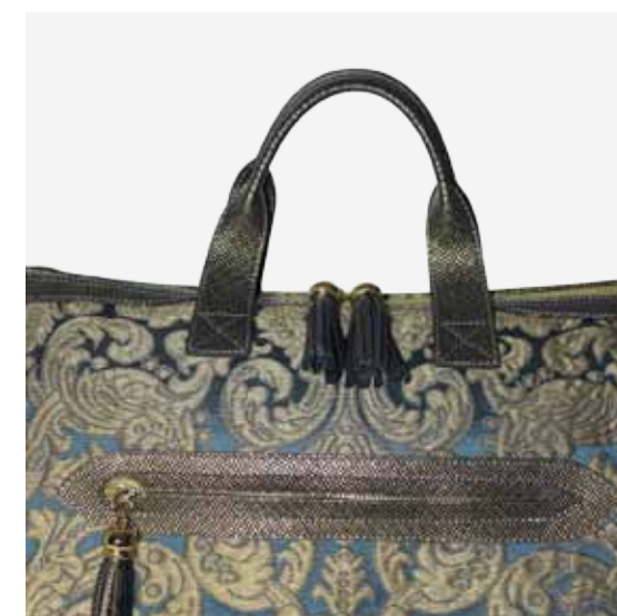
■ CD1124 _ DUFFLE