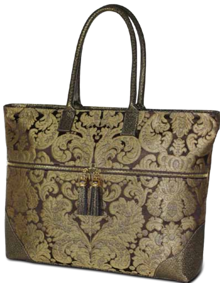
■ CD941 _ EAST WEST TOTE