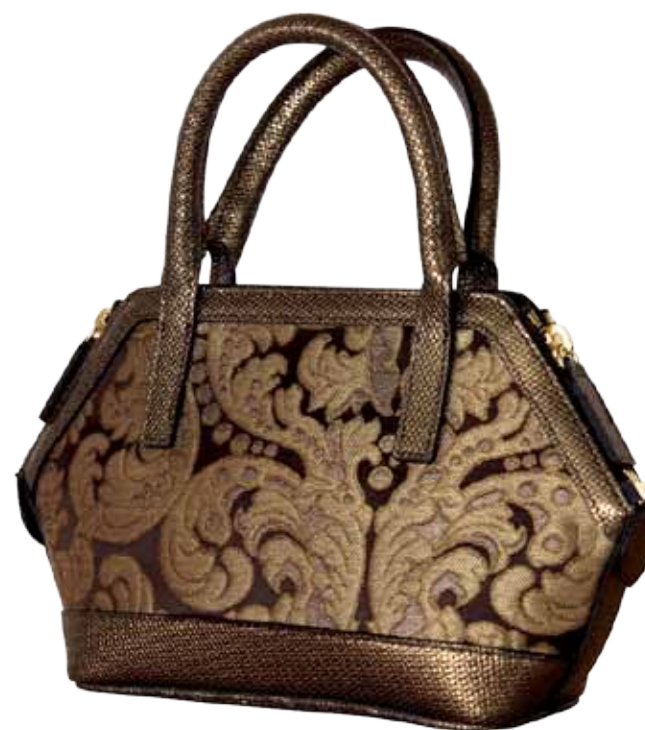
■ CD1302 _ HAND BAG b.29 x p.17 x h.8 cm