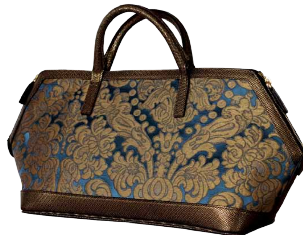
■ CD1301 _ HAND BAG b.45 x p.24 x h.11 cm