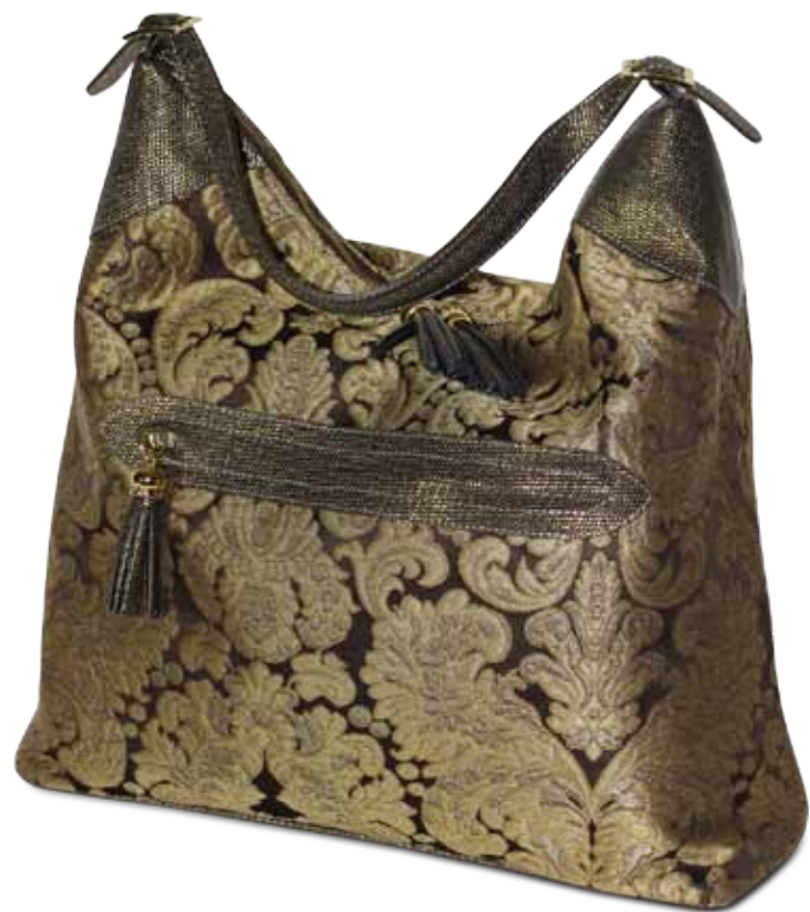
■ CD923 _ SHOULDER BAG