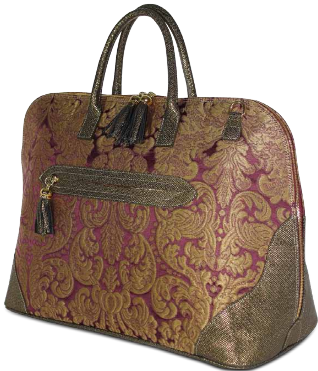
■ CD936 _ DUFFLE b.50 x p.24 x h.35 cm